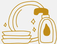
ENHANCED RESTAURANT PROCEDURES P. 59