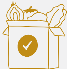
FOOD SAFETY CERTIFICATION P. 60