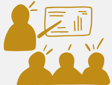
ADVISORY COUNCIL P. 63