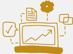
ADVANCED TECHNOLOGY P. 58